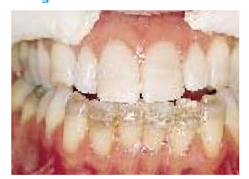
Figure 17 —A dentin shade of B1 composite (Herculite<sup>®</sup> XRV<sup>™</sup>) was used to mask most of the banding on the central incisors.