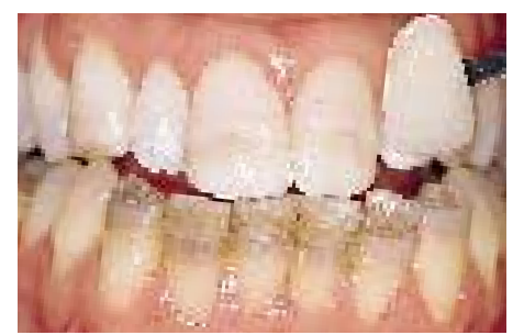
Figure 11—After approximately 12 months of nightly treatment, the teeth were slightly lighter than B1, but a faint banding was still present.