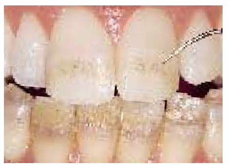
Figure 15—Rubbing the facial of the tooth with an explorer identified the older composite bonding. The patient now began whitening the mandibular arch.