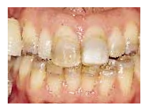
Figure 4—The shade of the gingival portion of the tooth was A3, but the tetracycline portion was darker than C4.