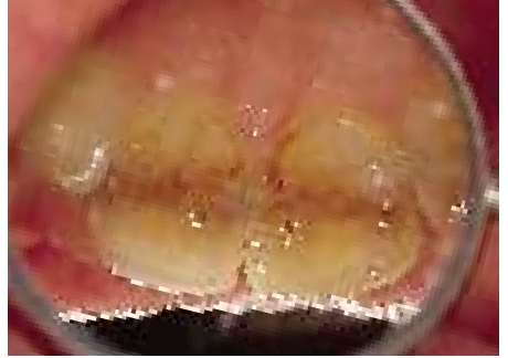
Figure 3—Although the facials of the teeth were covered with old bonding materials, a lingual view shows the dark banding in the middle third of the tooth.