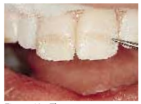
Figure 16—The remaining composite material was removed using a high-speed handpiece and carbide bur, cutting without water to help identify the composite resin.

composite veneers had debonded. The incisal edges of the canines were not covered with enamel (Figure 2). The tetracycline discoloration that had not been veneered was darker than C4 on a Vita ^{\text{\tiny M}} shade guide (Vident ^{\text{\tiny M}} ), and was located primarily in the incisal half of the teeth (Figure 3). There was also a distinctly darker band in the middle third of the teeth. The gingival area of the