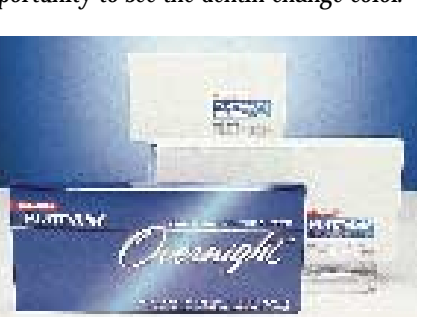
Figure 6—A 10% carbamide peroxide, Colgate Platinum Overnight<sup>™</sup>, was used overnight in a nonreservoir, nonscalloped tray design.