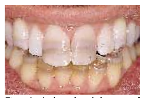
Figure 9—As the teeth got lighter, more of the excess composite was removed, revealing the heavy banding in the middle of the tooth

A 35-year-old man presented with moderate-to-severe tetracy-