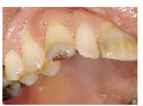
Figure 2—The enamel did not cover the dentin on the tips of the canines. This demonstrates how the color of the teeth is located in the dentin, and offers an excellent opportunity to see the dentin change color.

In 1997, the first study was published that explored at-home whitening of tetracycline-stained teeth with 10% carbamide peroxide in a custom-fitted tray. The study found that, by extending the treatment time, an acceptable