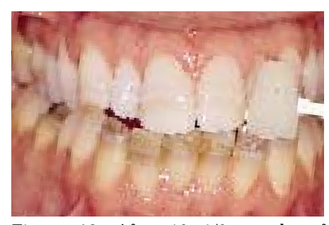
Figure 13—After 13 1/2 months of whitening and 2 weeks of color stabilization, the final whitening color was realized, which was still lighter than B1. The patient stopped whitening when he had gone 1 month with no obvious color change.