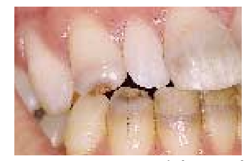
Figure 8—Examination of the exposed tetracycline-stained dentin on the canines revealed a lightening in color.