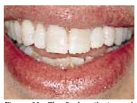
Figure 20—The final smile is much improved from the baseline. The patient also shaved his moustache, to show off his new smile.

However, the condition of the teeth underneath the existing composite bonding was still unknown.